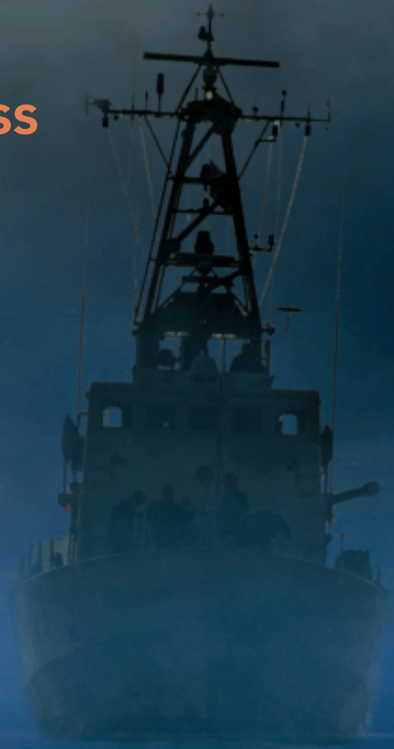
The Canadian Coast Guard uses ICAN's Aldebaran navigation system.

At the forefront of oceans technology in Atlantic Canada.